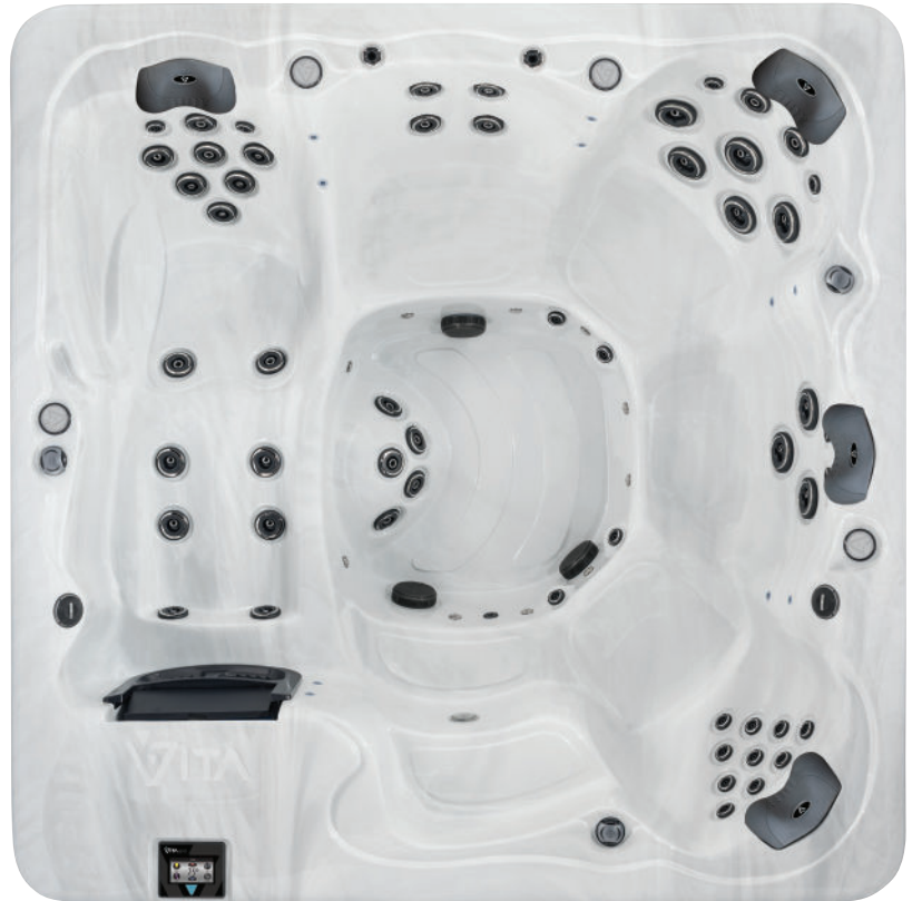
Specifications and styling subject to change. Shown with simulated AquaGlo accents and optional stereo.